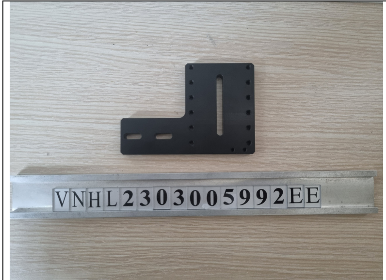
PHOTO OF SUBMITTED SAMPLE FOR TESTING

REPORT RESULTS REFER TO SUBMITTED SAMPLE (S) ONLY